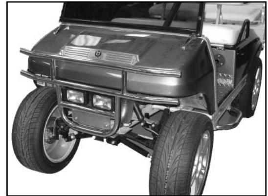
Shown with optional headlights (not included).